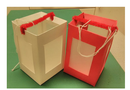
Above: The BWA will be making these lanterns to decorate a tree for the 2020 "Festival of Trees"

It's not too early for Christmas: Fifty of these lanterns will represent the theme, 'Light', on White River Temple's tree at the 2020 White River Valley Museum's Festival of Trees. Five volunteers have signed up to assemble them. Thank you for giving your time and talent. The decoration event at the Museum will be in November.