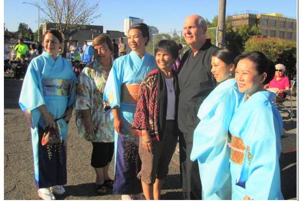
Obon 2018: May this bring you good memories of past Obons and inspire hope for the future.

Fall Gift Card Fundraiser. Date and details pending.